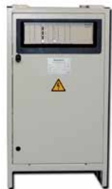
Switching Control Unit

The layout of the unit's current monitoring board allows lamp fault monitoring, and monitoring of clocked loads (e. g. flashing obstruction lights).