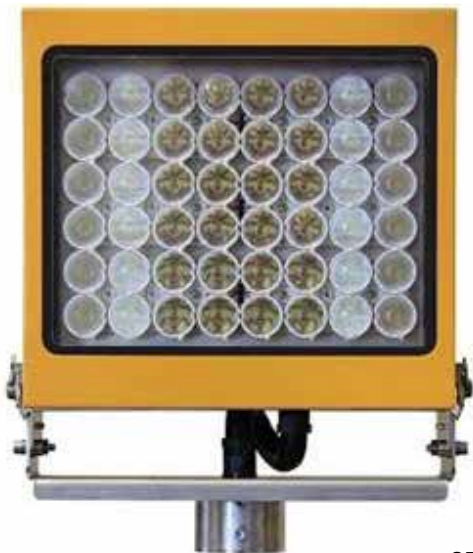
SFL48 LED- flash